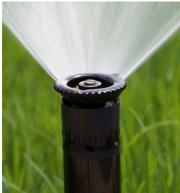
Voluntary Odd/Even Watering Program